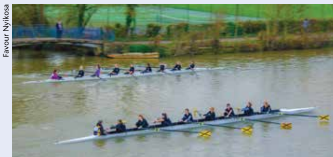
Linacre Boat Club Women's Race

The 2014 Christ Church Regatta took place in a wet and blustery Oxfordshire autumn. Difficult conditions had led the organisers to decree that only X-status coxes and above, with the experience to navigate more challenging river conditions, could race one of the over 100 boats of novices, who were eager to show the results of two months of training. Champing at the bit, Linacre entered two boats.