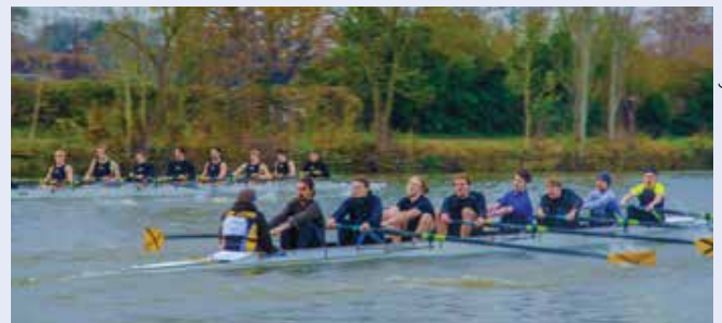
Linacre Boat Club Men's Race

From the start the women drew tough competition, narrowly losing their first round race to Wadham A. Victory over St Catz B the following day assured their survival, though requiring victory against St John's A. St John's were stunned by a powerful Linacre start, and struggled to pull away, but were gathered in by Linacre on the finish line. The final day saw Linacre versus Magdalen A. Magdalen, having confidently expected to leave Linacre on the start line, found themselves fighting to preserve the slenderest of leads. They finally dragged themselves over the line, Linacre snapping at their heels.