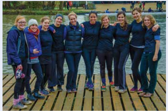
Linacre Boat Club Women's Team

From the start the women drew tough competition, narrowly losing their first round race to Wadham A. Victory over St Catz B the following day assured their survival, though requiring victory against St John's A. St John's were stunned by a powerful Linacre start, and struggled to pull away, but were gathered in by Linacre on the finish line. The final day saw Linacre versus Magdalen A. Magdalen, having confidently expected to leave Linacre on the start line, found themselves fighting to preserve the slenderest of leads. They finally dragged themselves over the line, Linacre snapping at their heels.