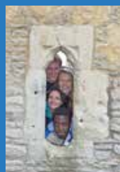
Cover image: Linacre students at Minster Lovell Hall (see p8).